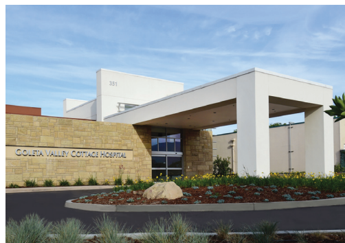
$66.5 million for new hospital construction and seismic retrofitting