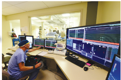
$13.8 million for new technology and information systems